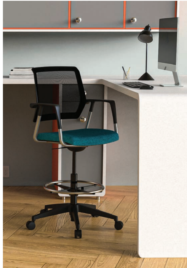
Seating shown is model TR-40-SK-BB-S

Trendi 2.0 Management chairs combine comfort and mobility, making it a great fit for working spaces, conference rooms, and learning areas. Featuring height adjustment mechanism and passive flex back, additional ergonomic support. During those extra-long meetings or training sessions, the optional upholstered seat provides the comfort you desire.