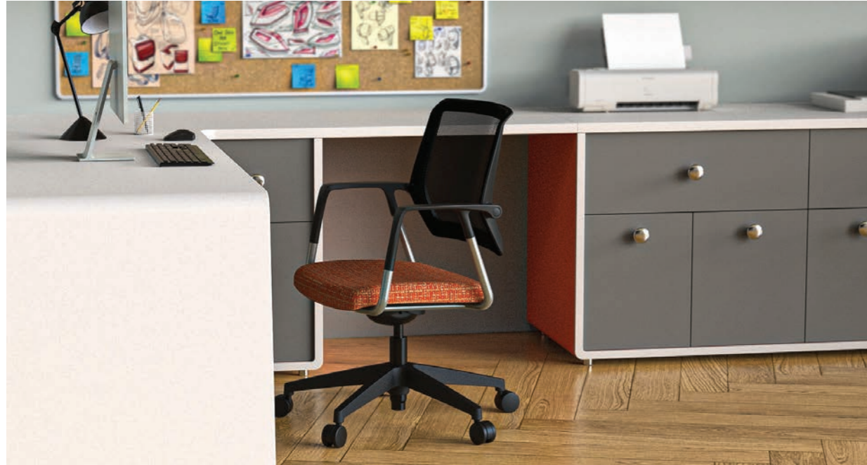
Seating shown is model TR-40-BB-S

Trendi 2.0 Management chairs combine comfort and mobility, making it a great fit for working spaces, conference rooms, and learning areas. Featuring height adjustment mechanism and passive flex back, additional ergonomic support. During those extra-long meetings or training sessions, the optional upholstered seat provides the comfort you desire.