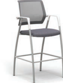
TR-26-WG Counter Height