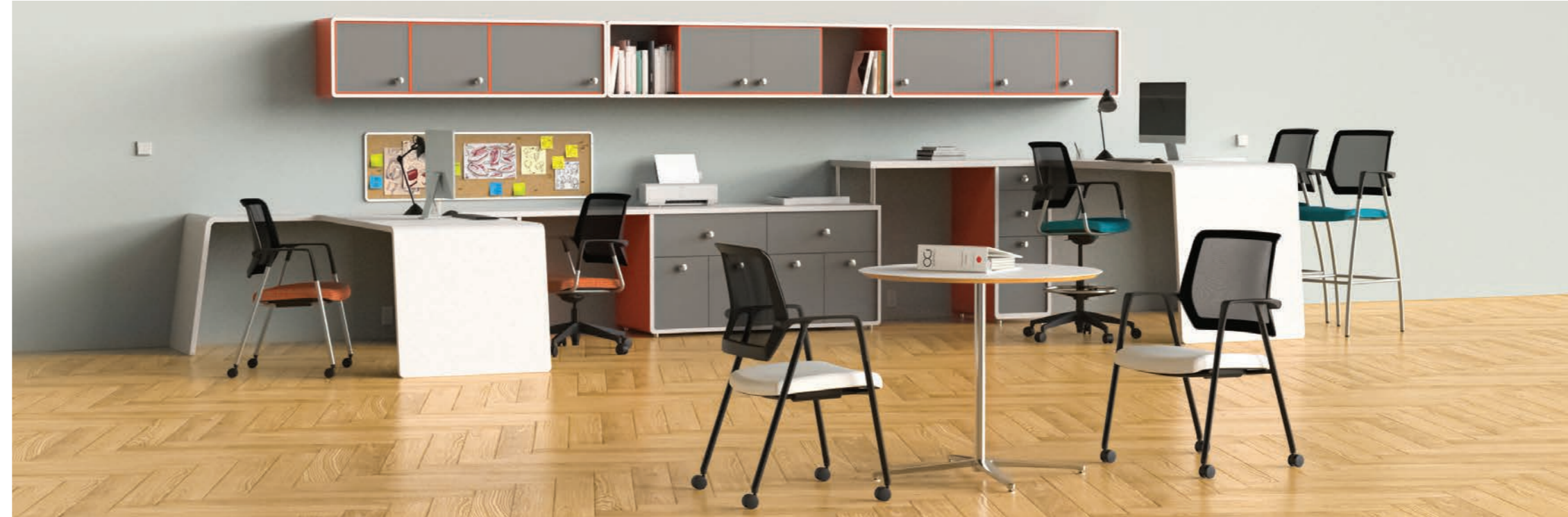
Seating shown are models TR-11-BB-S, TR-11-BB, TR-30-BB-S, TR-40-BB-S, and TR-40-SK-BB-S with Optional Seat Fabric