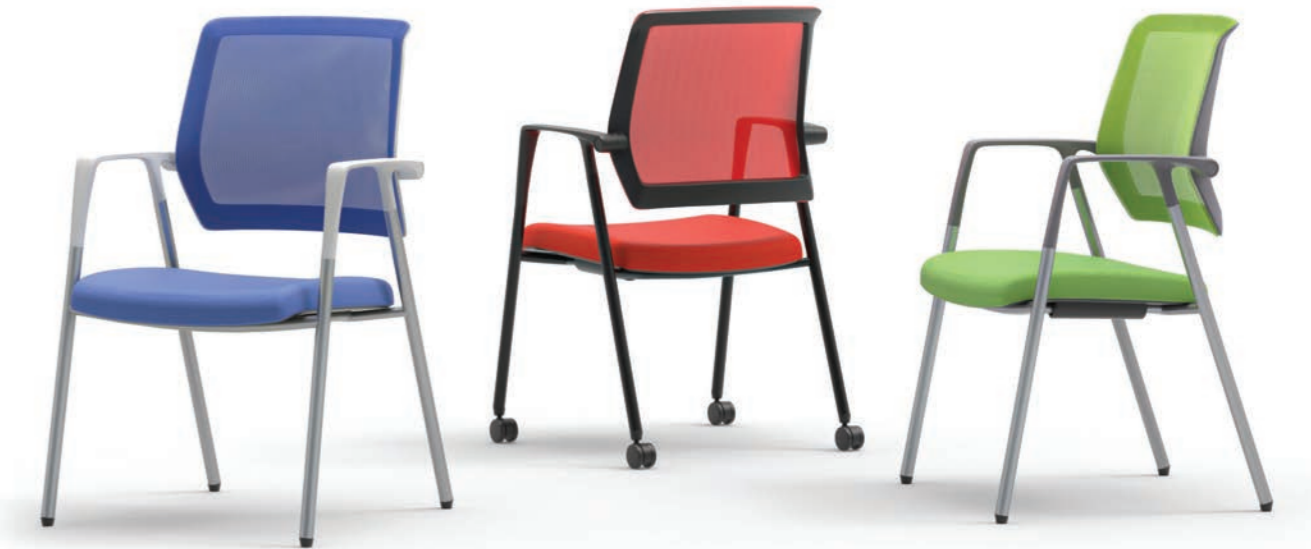
Seating shown are models TR-10-WG, TR-11-BB, and TR-10-GG shown with optional color mesh on passive flex backs

Trendi 2.0 Guest Chair, the perfect seating solution for any space. With its versatile design, comfortable flex back and customizable options, Trendi 2.0 Guest Chair offers a seamless blend of style and comfort. The mix and match metal the silver and black frame finishes, the grey, white and black plastic back and arm finish and the different meshes will allow you to personalize the chair to match your space's aesthetic. From its gracefully subtle curves to the unique sweeps on the back, the Trendi 2.0 Guest Chair is a true masterpiece of form and design.