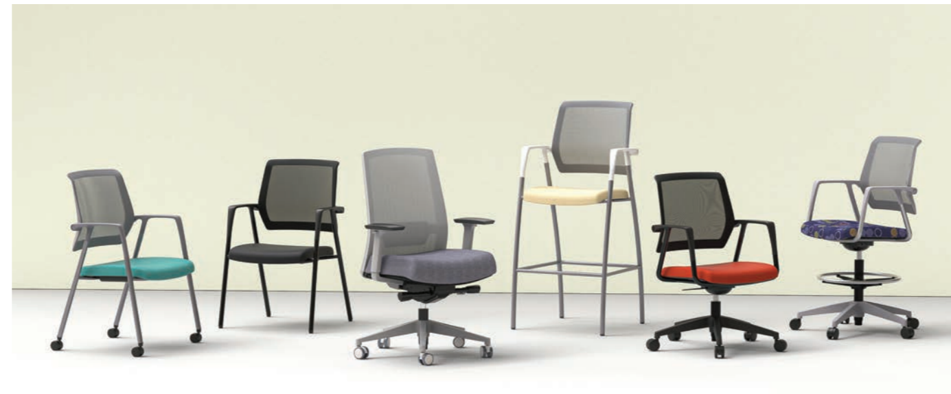
Seating shown from left to right are models TR-11-GG, TR-10-BB, TR-2.0-638-GG, TR-30-WG, TR-40-BB, and TR-40-SK-GG

Say goodbye to uncomfortable seating and hello to the ultimate seating solution with Trendi 2.0! Whether you need a task chair office, a stylish side chair for your meeting room, or a comfortable stool for your high counter, Trendi 2.0 has got you covered. With its innovative design and focus on promoting comfort and well-being, this collection is perfect for any environment. Get ready to enhance your performance while sitting in style with Trendi 2.0!