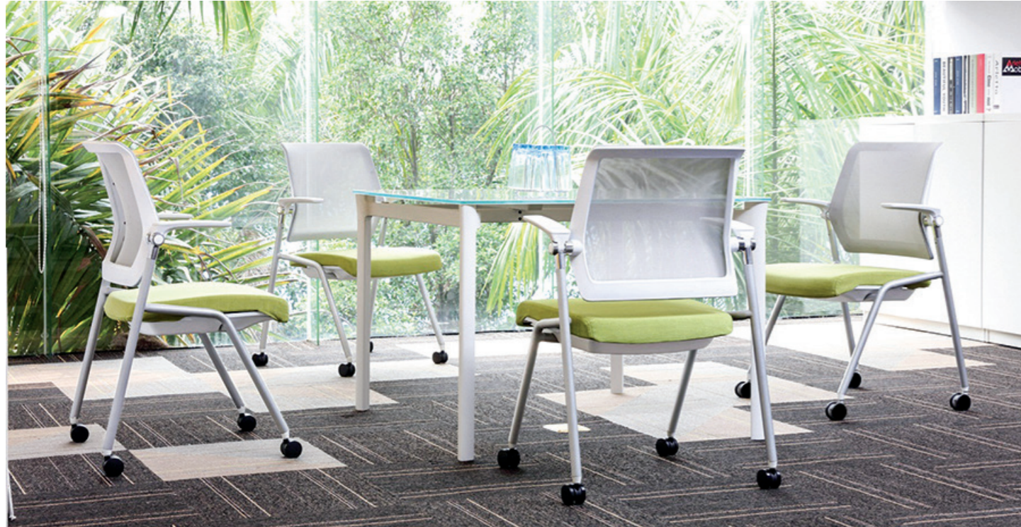
Seating shown is model TR-15-WG with Optional Seat Fabric

Trendi Nesting is our multipurpose wonder, effortlessly transforms from guest chair to nested to stacked, making storage and space management a breeze. With its sleek profile, contoured seat, passive back tilt and flip-up arms, Trendi Nesting redefines style, comfort, and performance in one elegant package.