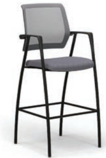
TR-30-BG Bar Height