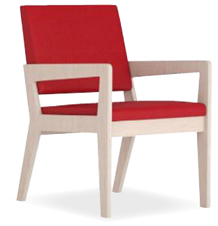
351 21.5 W x 23.75 D x 31.5 H