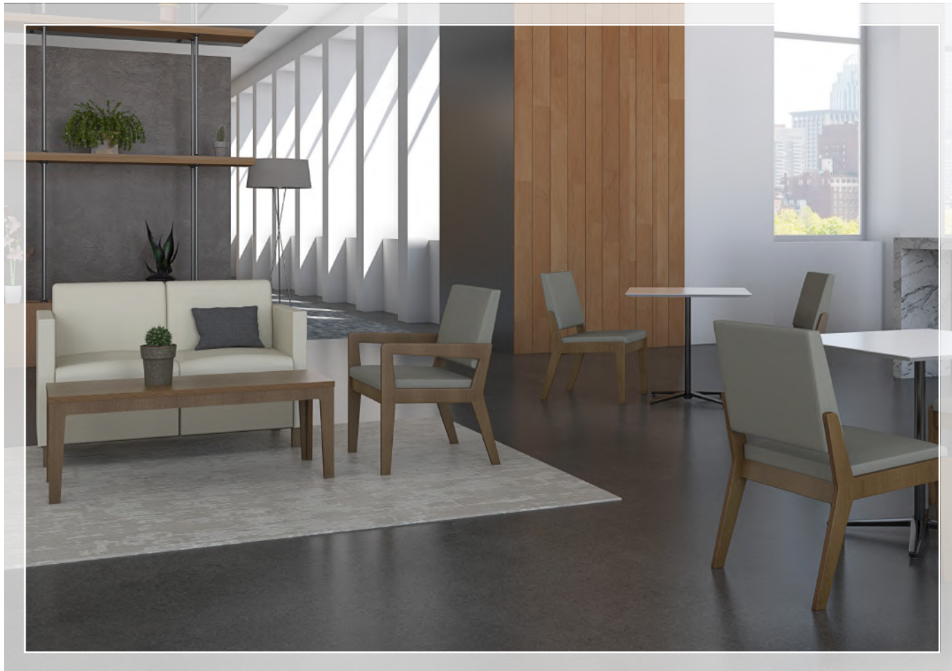
Seating shown are models 350 Armless and 351 Arm Chairs in Mayer Ranchero Nickel and Cafe Finish on both chairs and TC204817 Coffee Table. Also shown are EL Tables and 712 Love Seat in Castillo Cream Vinyl.