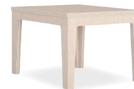
TC222217 End Table 22 W x 22 D x 17 H