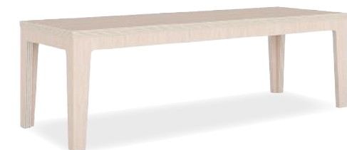
TC482017 Coffee Table 48 W x 20 D x 17 H