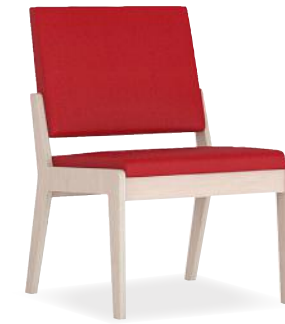
350 21.5 W x 23.75 D x 31.5 H