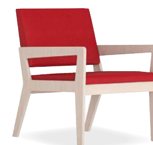
361 27 W x 23.75 D x 31.5 H