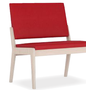
360 27 W x 23.75 D x 31.5 H