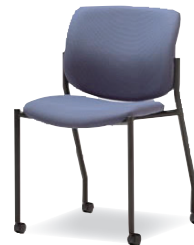
C-14-NA-C Guest, Caster, Armless