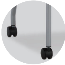
Soft Floor Casters