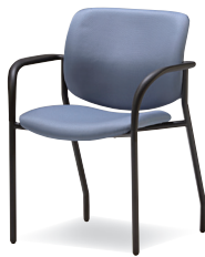
C-14 Guest, Glide, Arm