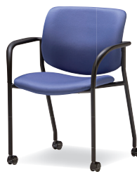
C-14-C Guest, Caster, Arm