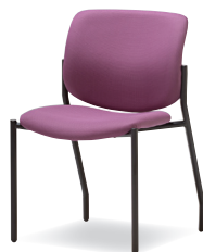
C-14-NA Guest, Glide, Armless