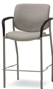
C-14 Stool, Glide, Arm