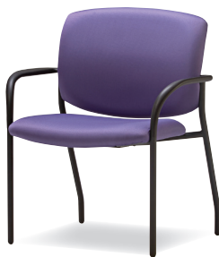
C-14-500 Bariatric, Arm