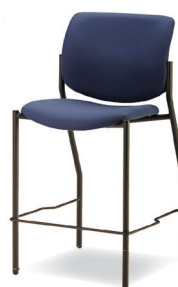
C-14-NA Stool, Glide, Armless

Seating shown are models C-14 NA and C-14 (Cover)