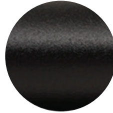
Black Frame Finish