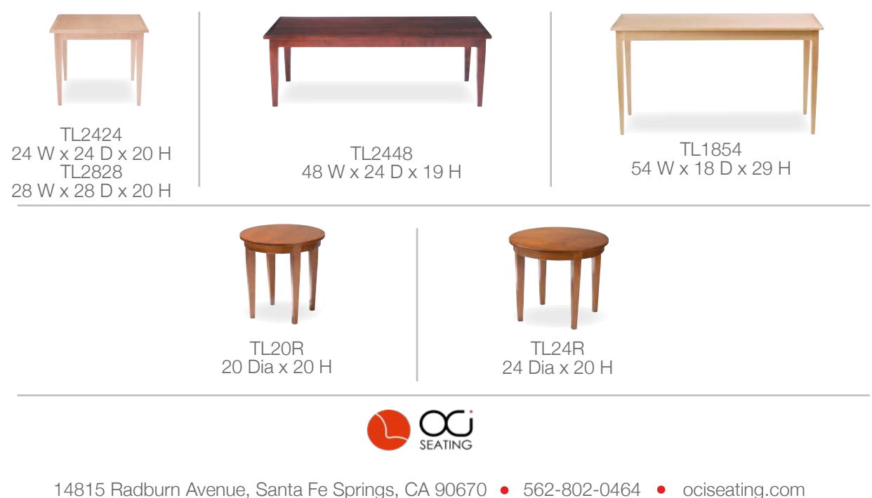
Table legs are manufactured in Maple with 18 different finishes to choose from and are available in multiple sizes. Custom wood finishes are available. Rectilinear Tables are available in a wood Veneer or Laminate top (special order). Wood table tops have a mitered hardwood edge banding. Round Tables come standard with solid hardwood tops.